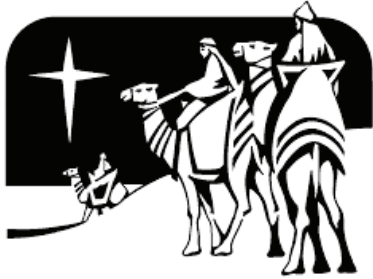
The Epiphany of Our Lord